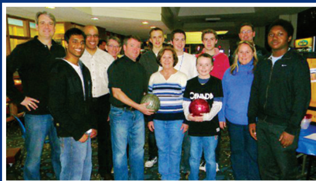
Part of the PC team at a recent fundraiser!